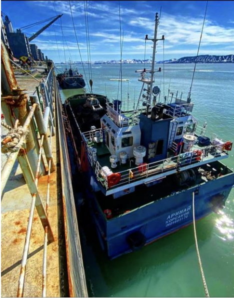
TIG 500t barge unloading

TIG has successfully started the 2020 shipping season – the first season in which TIG fully manages all port activities. Preparations for the season included extensive dredging works, bringing and training over 70 port personnel to Beringovsky, repair works on apartments and other housing and lodging arrangements, maintenance of the coal loading system, repair works on our fleet and obtaining all necessary licenses and approvals.