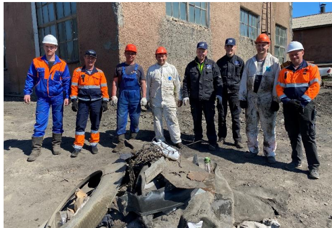
Garbage collection in port

Managing the environmental impact of TIG's activities is a key priority for the Company. On World Environment Day (June 7 th ) for the third year in a row TIG staff organized trash and industrial garbage collection in the township to improve the safety and overall quality of the local environment. TIG has created a hotline for enquiries regarding mining and ecology in Beringovsky.