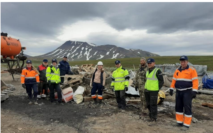
Trash and industrial garbage collection in camp