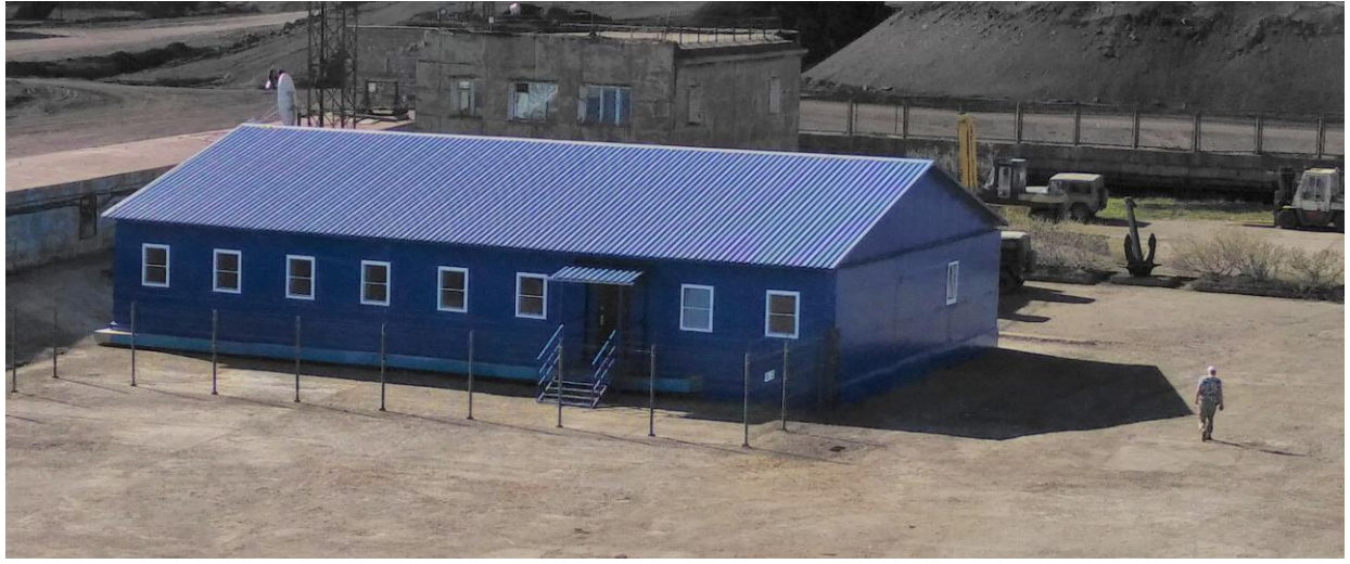
The new customs checkpoint at Beringovsky Port