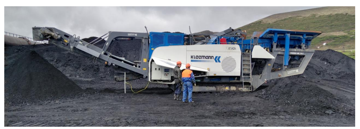
Commissioning the Kleemann Coal Crusher

TIG's expectation is to have two to three trial cargos of semi soft coking coal sold to major North Asian steel mills for 2017 delivery. In addition, a 40kt cargo of higher quality thermal coal (6000 kcal/kg NAR) is currently under discussion for August loading which will be at a price significantly higher than that of the July low CV cargo.