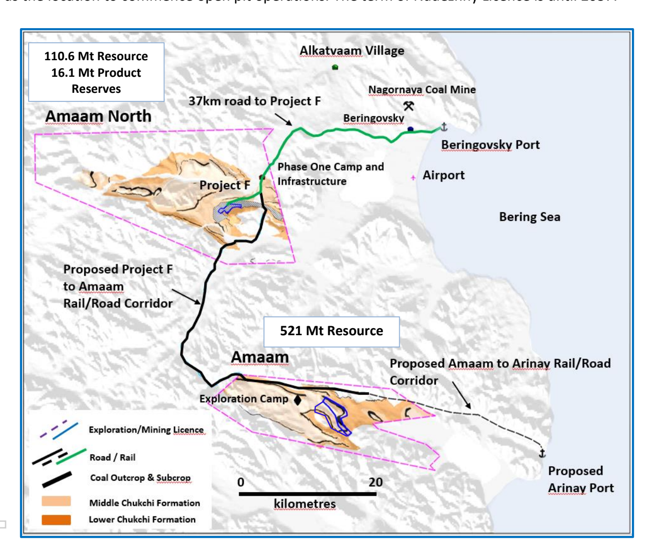
Figure 2 Amaam and Amaam North Coking Coal Projects

TIG is pleased to report that it has received positive approval to its licence application and now holds a second Extraction and Exploration (Mining) Licence at its Amaam Project, located approximately 40 kilometers to the south of its currently operational Project F (Figure 2). Figure 4 (on page 4) shows the location of the "Nadezhny" Licence and TIG's previously acquired Mining Licence, Zapadniy. The two licences together cover Area 3, which was identified in the Amaam Pre-feasibility Study (PFS) as the location to commence open pit operations. The term of Nadezhny Licence is until 2037.