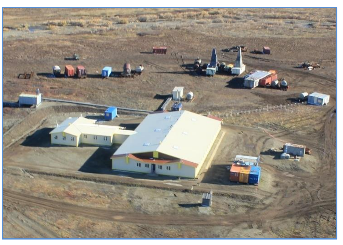
Figure 1 Amaam Exploration Camp

TIG is pleased to report that the Russian Subsoil Agency (Rosnedra) has granted a second Extraction and Exploration (Mining) Licence at the Amaam Project in the Beringvovky region of Chukotka, Far East Russia. This new Licence is located to the south of its recently launched Project F operations and gives the company long term tenure and mining rights over Area 3 of the Amaam deposit. Area 3, located in the central part of the Amaam deposit, was identified In the Amaam Open Pit Pre-feasibility Study as the location for the commencement of open pit mining.