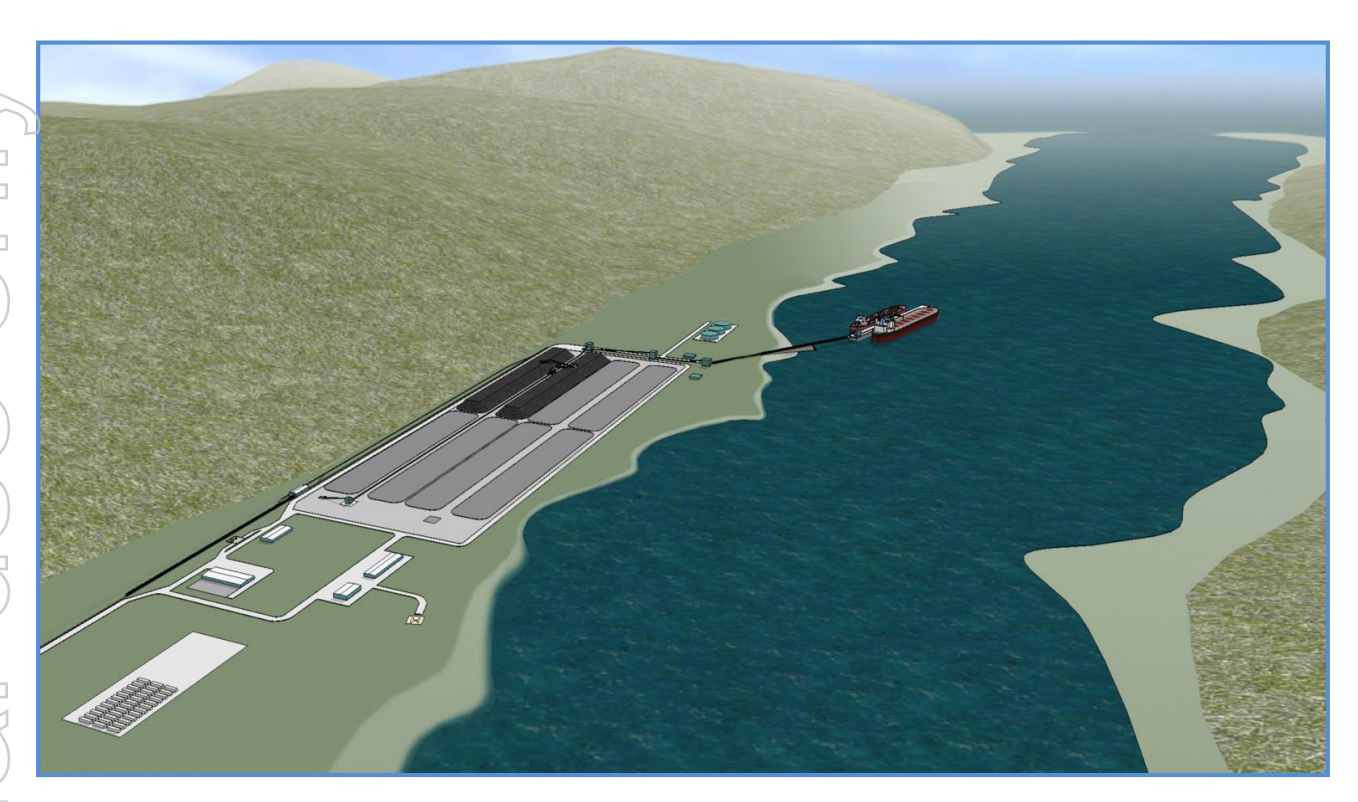
Figure 3 Arinay Lagoon Port Design

The deep water Arinay Lagoon has the potential to receive capesize vessels and conduct all year round loading and shipping operations. Product from the Amaam operation will be a high vitrinite content (>90%) coking coal with excellent coking properties.