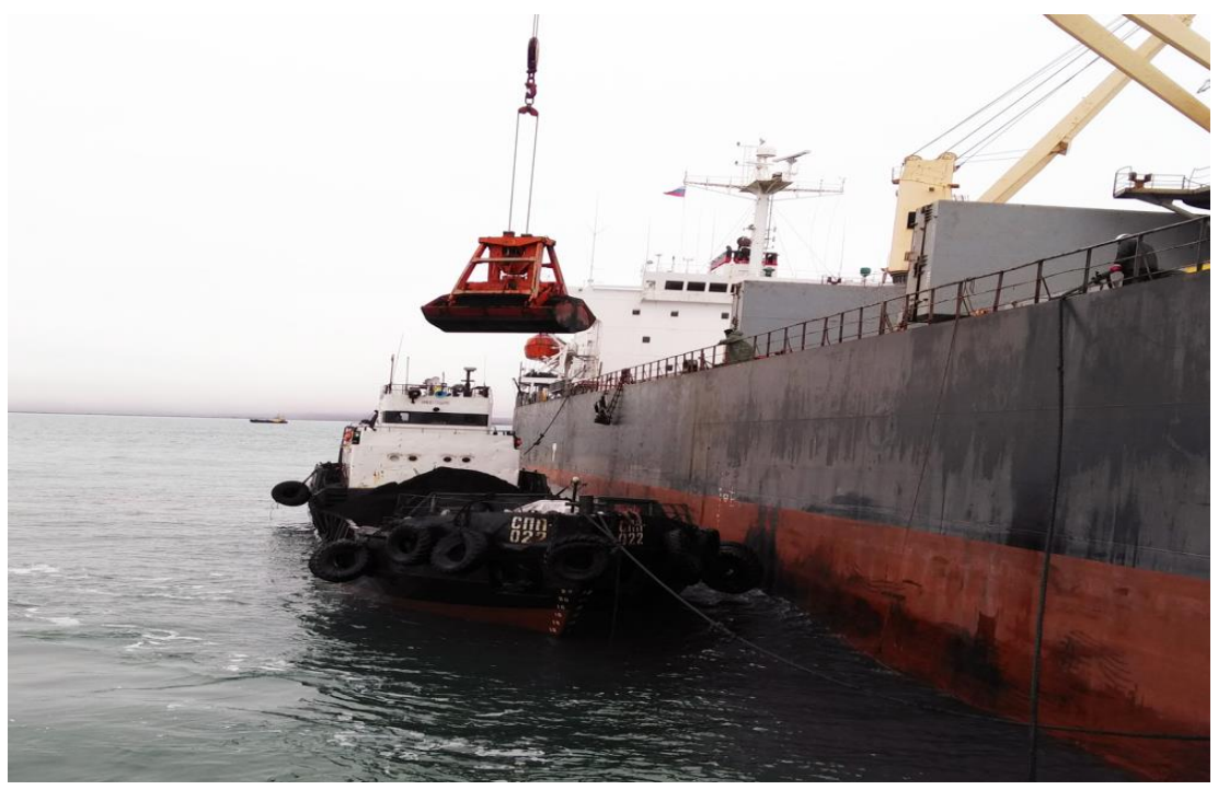
Beringovsky Port vessel loading operations: summer 2018