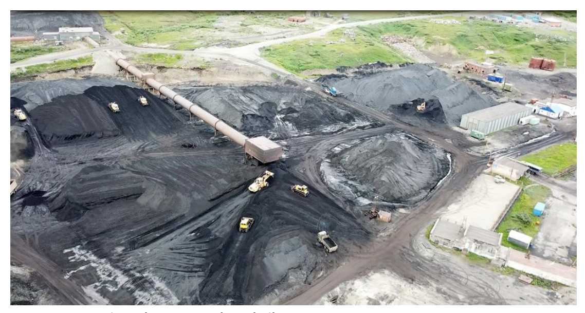
Beringovksy Port coal stockpiles: Summer 2018

Our coal products have been well received with coal quality testing of shipments achieving and exceeding client expectations. After a slow start influenced by unexpectedly adverse weather conditions in June, coal loaded to 31 August is 239kt. The results for the first half of the shipping season places us well to realise our sales tonnage targets, given the port stockpiles of 232.1kt in addition to expected September and October production of between 120kt to 140kt. We currently expect to end the season in line within the previous sales guidance range of between 440 and 495kt.