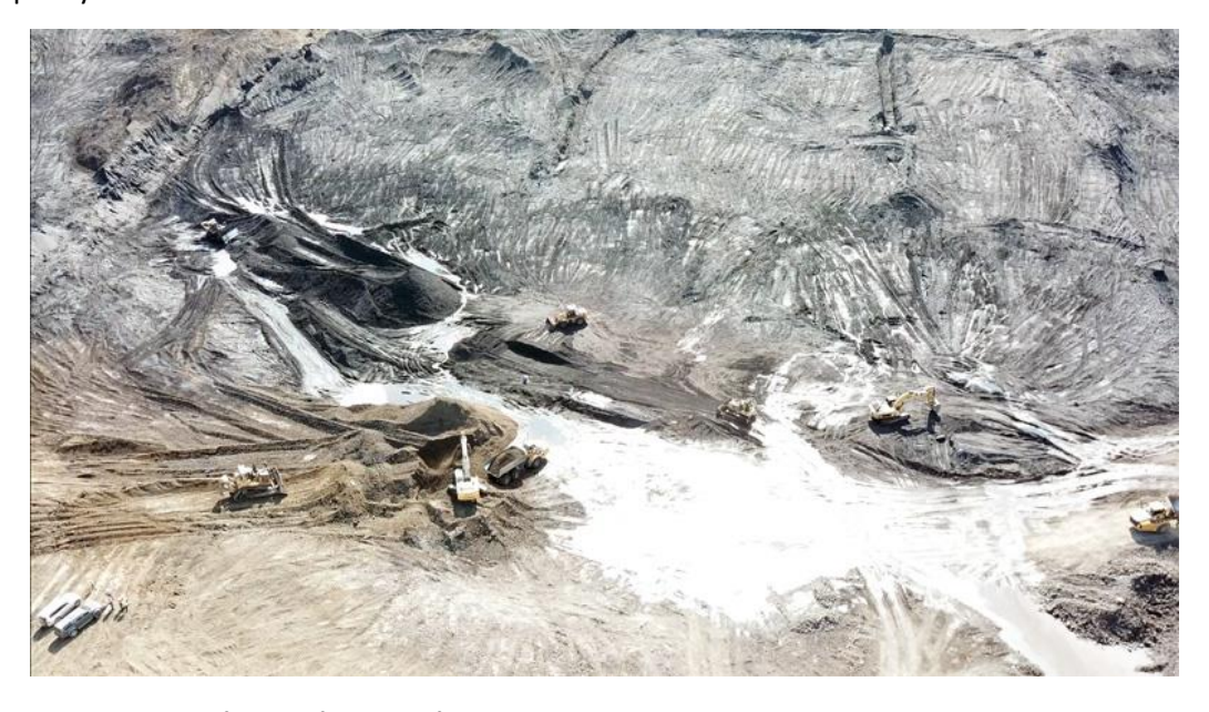
TIG Project F Pit operations summer 2018

Production for the July-August period has been positively influenced by taking delivery of two additional Scania haulage trucks, an excavator and bulldozer at the end of June and TIG has taken delivery of a further two Scania haulage trucks at the Beringovsky Port on 4 September, which are expected to further enhance haulage capacity.