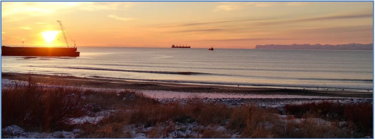
Transshipping coal, the last vessel of the 2017 season