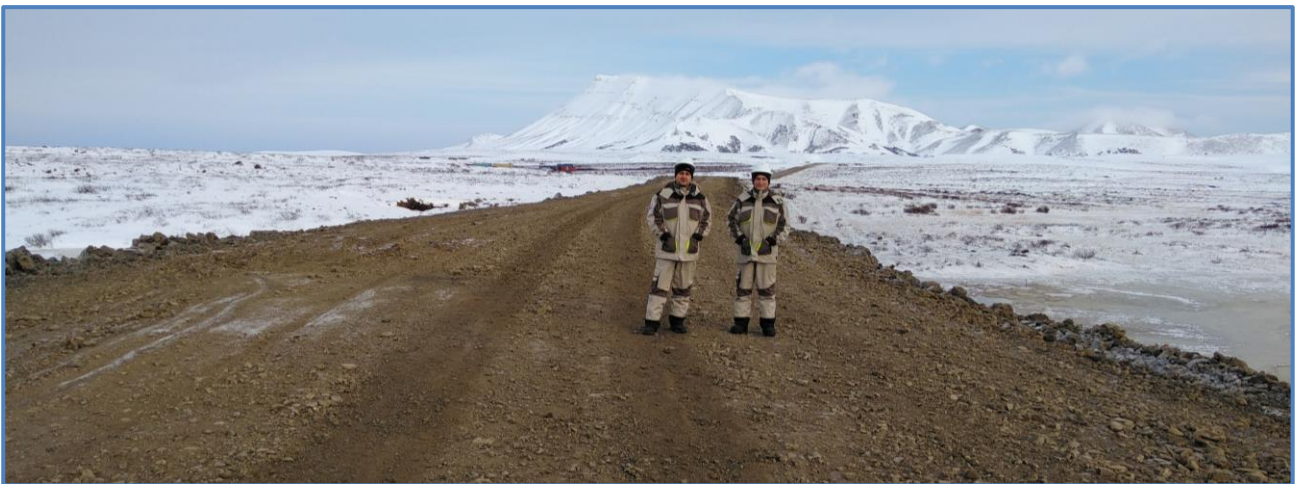
The haul road prior to recommencement of coal haulage in December