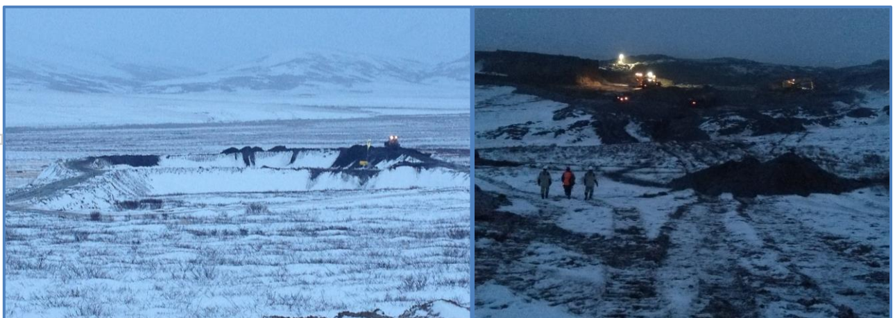
Constructing sedimentation ponds