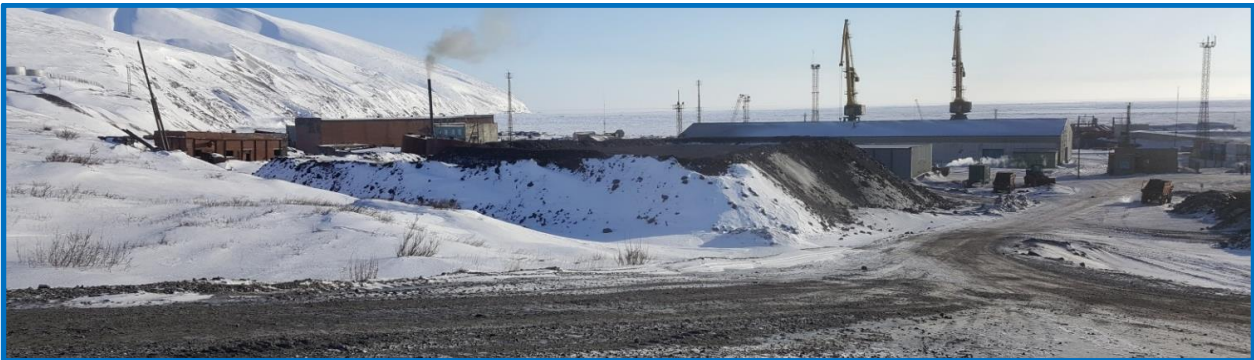
30,000 tonne stockpile at Beringovsky Port