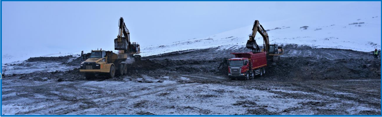
Loading waste and coal into trucks in the Project F pit