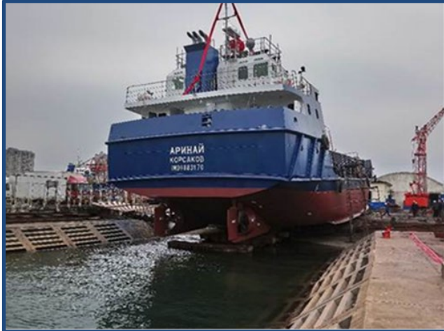
Launching of the "Arinay" 500t barge for sea trials on 20 April

The Company continues to invest in operating capacity, particularly in enhancing port throughput capabilities. In the March 2019 quarter, the construction in China of two 500t barges contracted in 2018 continued, the barges launched for their sea trials in April. Their delivery to Beringovsky port and final commissioning is expected to be completed in the first half of the 2019 shipping season.