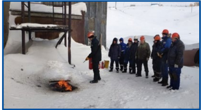
Demonstration of fire management drills