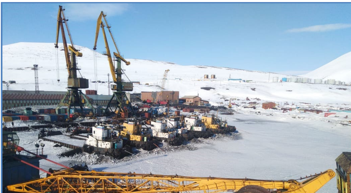
Beringovsky port 17 April 2019

TIG commenced a range of preparatory works to ensure its capacity to utilise any weather-related shipping opportunities which may arise should the ice thaw arrive earlier than expected. Accordingly, planned port infrastructure works commenced, including the general inspection, testing, repair and maintenance of all onshore infrastructure. Specific works on sea wall strengthening and coal pier repairs also began, this work programme is currently on track to be completed in readiness for the 2019 shipping season.