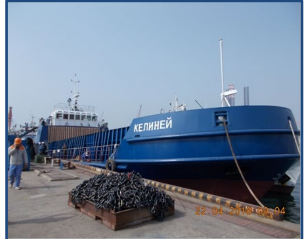
The "Keliney" 500t barge ready for sea trials on 20 April