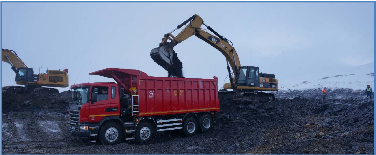
Loading coal in the Project F pit