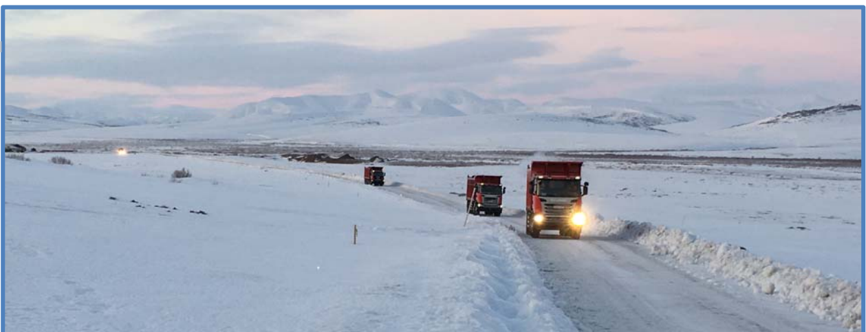
Trucking coal to Port