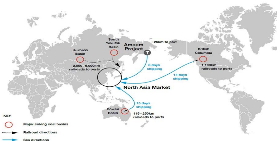
Amaam Coking Coal Projects – World Location Map

Amaam is a core asset of the Group, being a potentially long life project with capacity for up to 6.5Mtpa of high quality coking coal product from a combination of open pit and underground mining over an estimated 20 year life of mine. It involves the construction of a coal handling and preparation plant ("CHPP") and associated infrastructure, a coal terminal with loading facilities on the nearby Arinay Lagoon and an all-weather 25km rail line or road to connect them. A Feasibility Study was released in April 2013 and since then the Group has completed further drilling and exploration activities, updated the resource estimate and obtained Exploration Licence extensions through to 2019, which enables the Company to continue its resource drilling programs, feasibility studies and works required to convert its Coal Resource to Extraction and Mining Licences. Further details on the current status of the Group's licences are disclosed below in Significant Business Risks: Licenses, Permits and Titles .