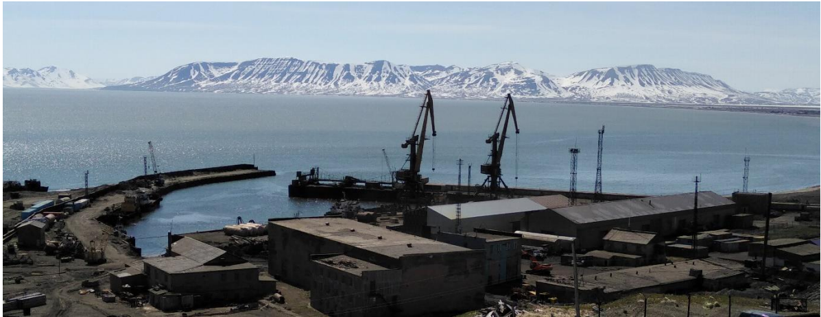
Beringovsky Port clear of ice and ready for transshipment - 18 June 2018