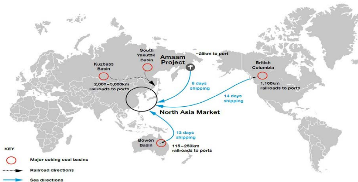
Amaam Coking Coal Field– World Location Map

Amaam is a core asset of the Group, being a potentially long-life project with capacity for up to 6.5Mtpa of high quality coking coal product from a combination of open pit and underground mining over an estimated 20-year life of mine. It involves the construction of a CHPP and associated infrastructure, a year-round coal terminal with loading facilities on the nearby Arinay Lagoon and a 25km rail line or road to connect them. A Preliminary Feasibility Study was released in April 2013 and since then the Group has completed further drilling and exploration activities, updated the resource estimate and obtained two long-term (20 year) Extraction and Exploration Licences over parts of the deposit, and extended the Exploration Licence. The Company plans to commence an update of the Amaam development model to assess the most efficient means by which to develop this significant coal resource. Further details on the current status of the Group’s licences are disclosed below in Significant Business Risks: Licenses, Permits and Titles .